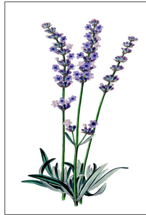
Native Plant or Shrub