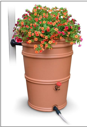
Rain Barrel with Diverter

Questions on eligibility? Call (614) 486-9613 or visit www.communitybackyards.org .