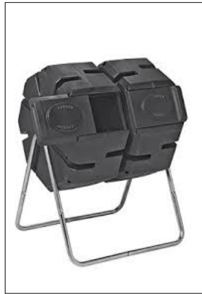
Enclosed Compost Bin